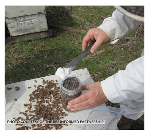
Tools for Varroa Management | Page 7

See the References and Additional Resources section for journal articles on sampling methods.